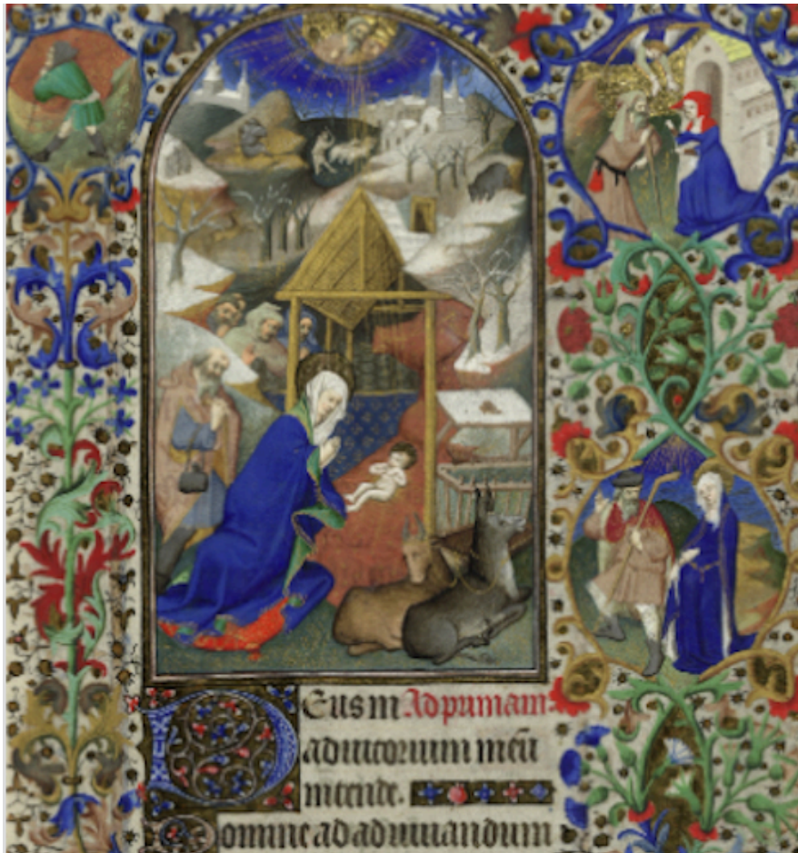
“Nativity” illumination from Bedford Hours (c. 1410-30)

Diocese of Melbourne - Anglican Church of Australia Parish Church of the City since 1846