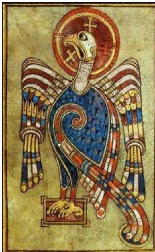
“St John’s Gospel” illumination, Book of Kells (c. 800AD)