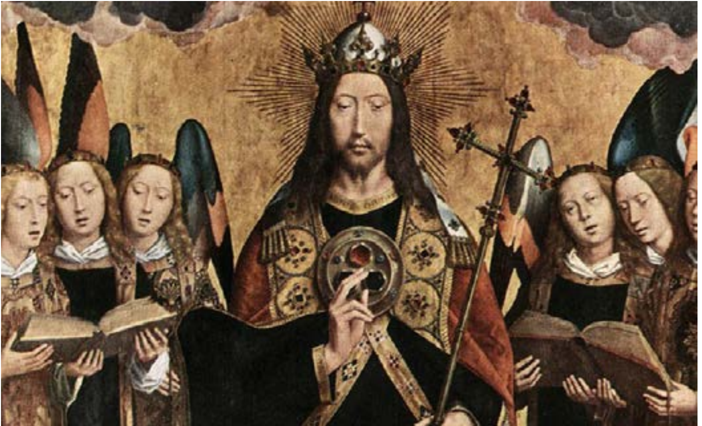
'Christ Blessing, central panel from a triptych', Hans Memling (c.1487 - 1490)

Diocese of Melbourne - Anglican Church of Australia Parish Church of the City since 1846