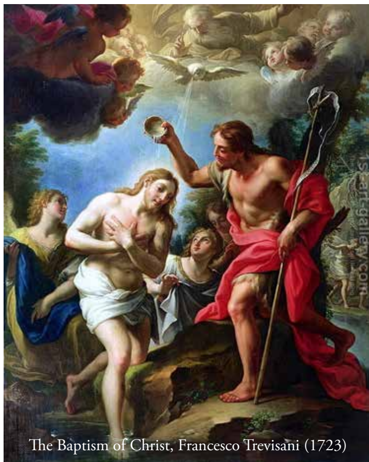
The Baptism of Christ, Francesco Trevisani (1723)