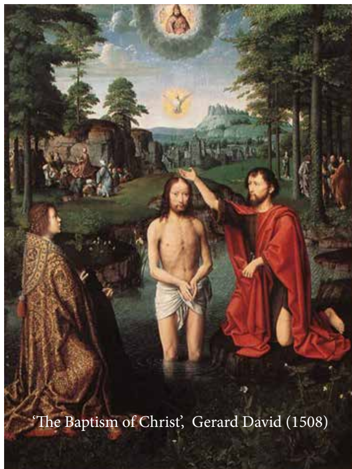
'The Baptism of Christ', Gerard David (1508)