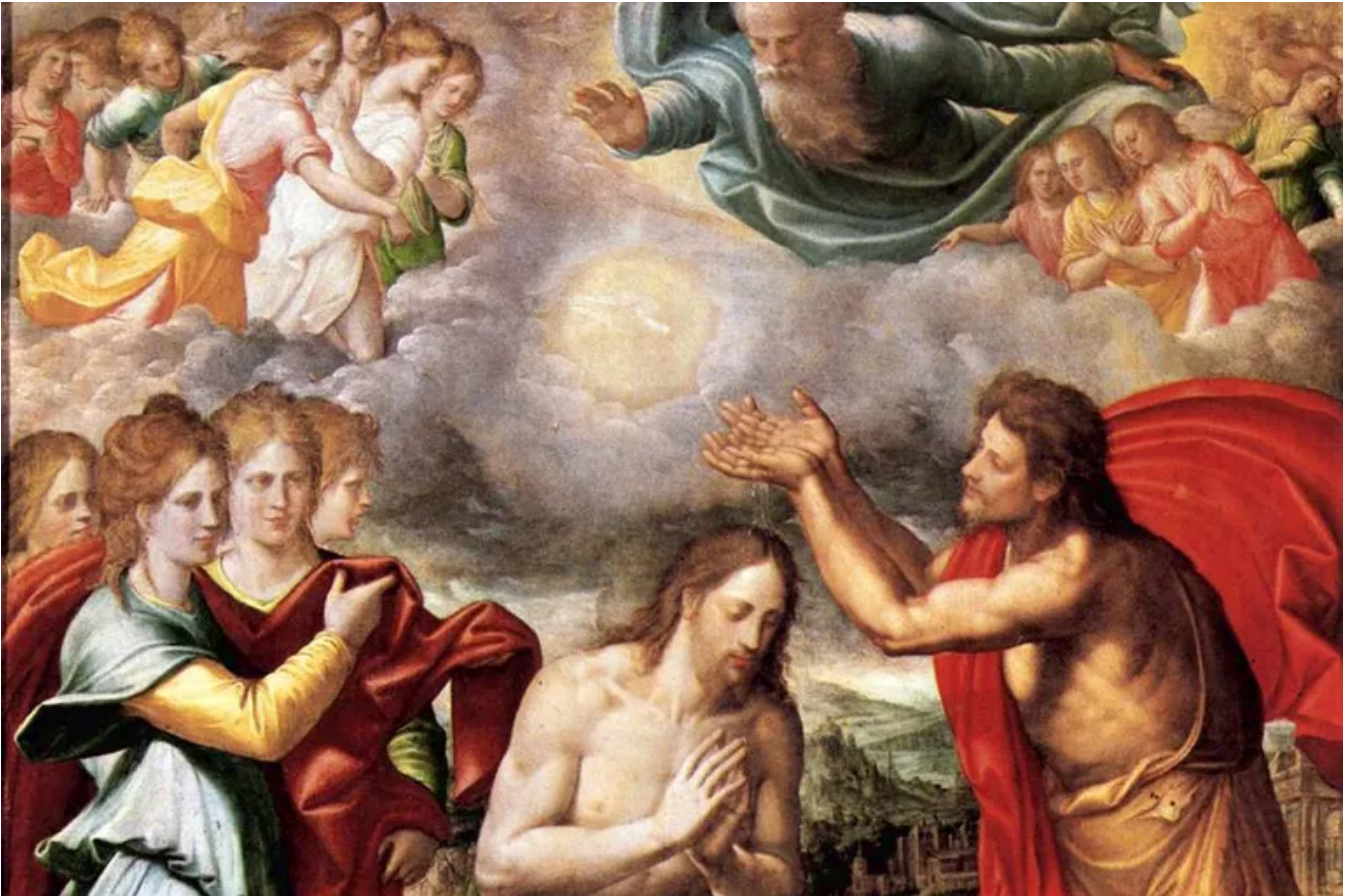
Bautismo de Cristo by Juan Fernández de Navarrete, circa 1567.

Diocese of Melbourne – Anglican Church of Australia Parish Church of the City since 1846