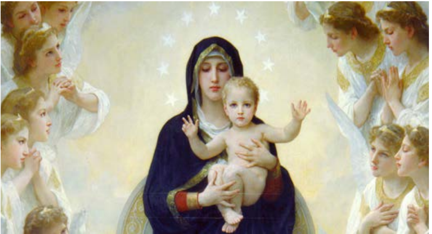
'The Virgin With Angels' (detail), William-Adolphe Bouguereau (c.1900)

Diocese of Melbourne - Anglican Church of Australia Parish Church of the City since 1846