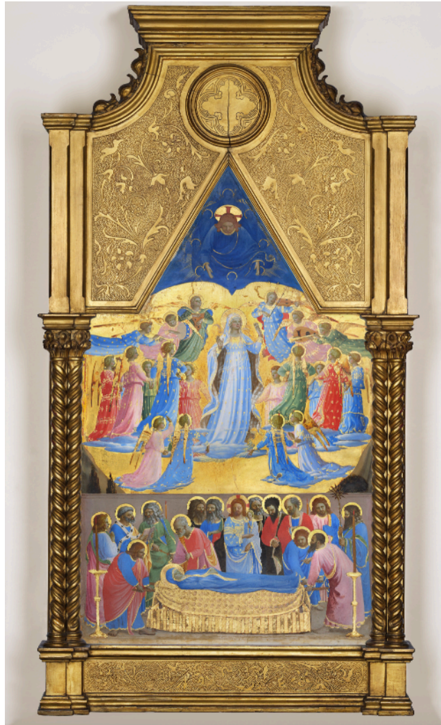
Fra Angelico, "The Dormition & Assumption of the Virgin" (1424-34)

Diocese of Melbourne - Anglican Church of Australia Parish Church of the City since 1846