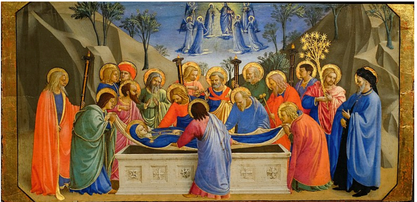
Fra Angelico, "The Dormition and Assumption of the Virgin" (c. 1425)

Diocese of Melbourne - Anglican Church of Australia Parish Church of the City since 1846