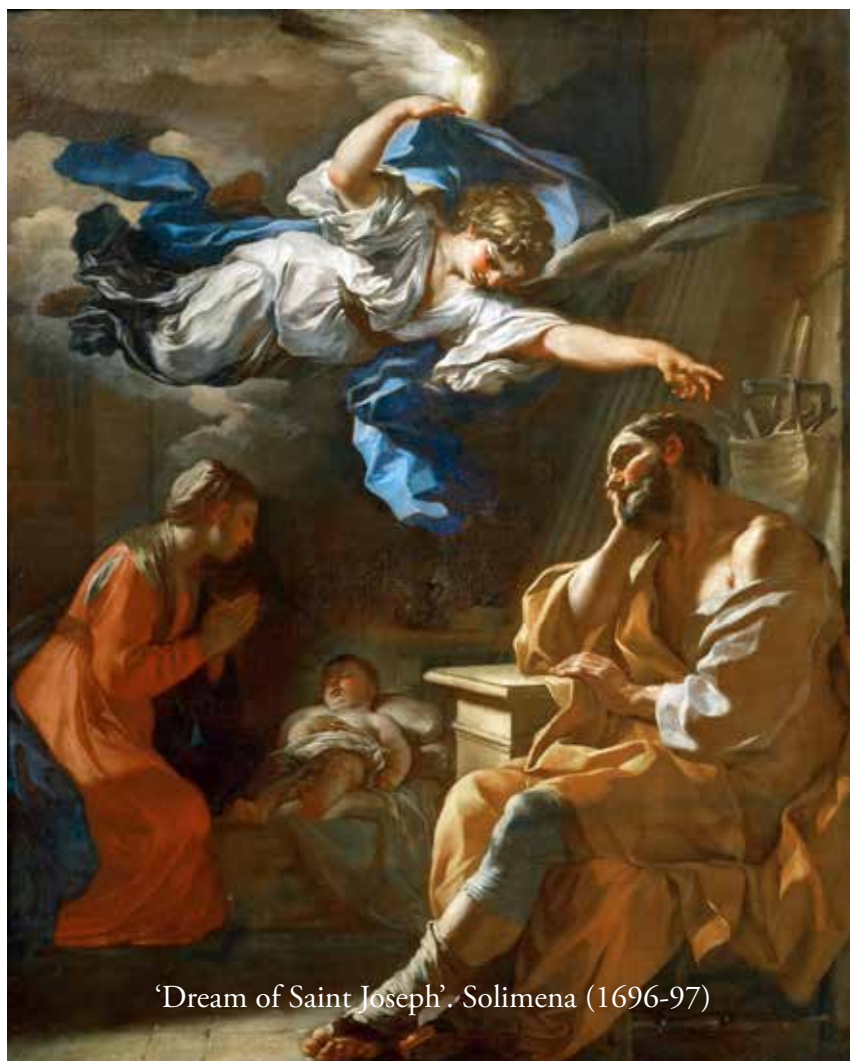
'Dream of Saint Joseph', Solimena (1696-97)

The birth of Jesus the Messiah took place in this way. When his mother Mary had been engaged to Joseph, but before they lived together, she was found to be with child from the Holy Spirit. Her husband Joseph, being a righteous man and unwilling to expose her to public disgrace, planned to dismiss her quietly. But just when he had resolved to do this, an angel of the Lord appeared to him in a dream and said, "Joseph, son of David, do not be afraid to take Mary as your wife, for the child conceived in her is from the Holy Spirit. She will bear a son, and you are to name him Jesus, for he will save his people from their sins." All this took place to fulfil what had been spoken by the Lord through the prophet: "Look, the virgin shall conceive and bear a son, and they shall name him Emmanuel," which means, "God is with us." When Joseph awoke from sleep, he did as the angel of the Lord commanded him; he took her as his wife.