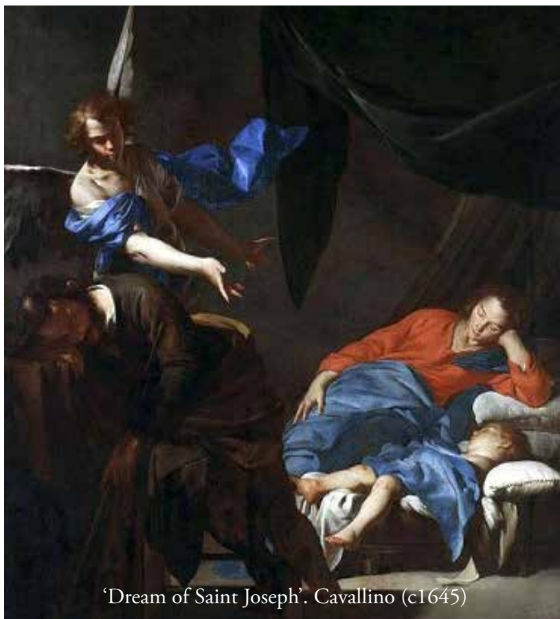
'Dream of Saint Joseph'. Cavallino (c1645)

Diocese of Melbourne - Anglican Church of Australia Parish Church of the City since 1846