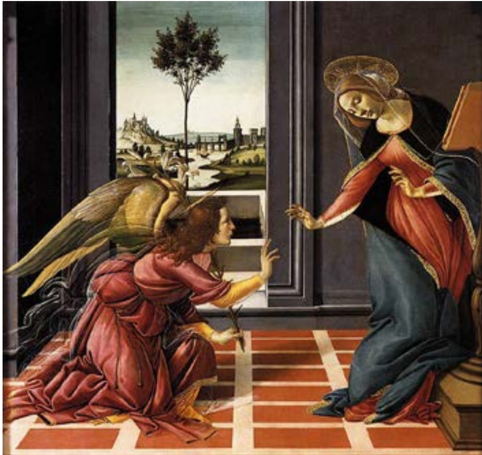
'Cestello Annunciation', Sandro Botticelli (1489)

Diocese of Melbourne - Anglican Church of Australia Parish Church of the City since 1846