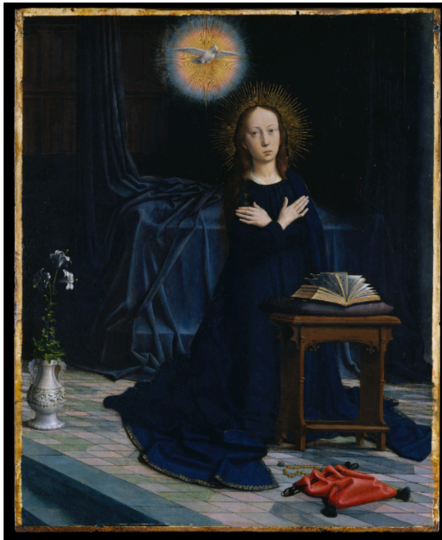
Gerard David, "The Annunciation" detail (1506)

Diocese of Melbourne - Anglican Church of Australia Parish Church of the City since 1846