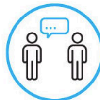
Please be kind and care for one another in these stressful times of change