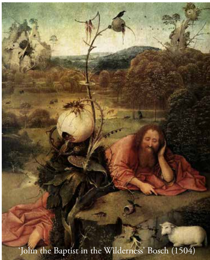
'John the Baptist in the Wilderness' Bosch (1504)