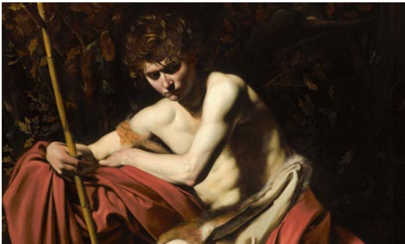
'Saint John the Baptist in the Wilderness', Caravaggio (1605)

Diocese of Melbourne - Anglican Church of Australia Parish Church of the City since 1846