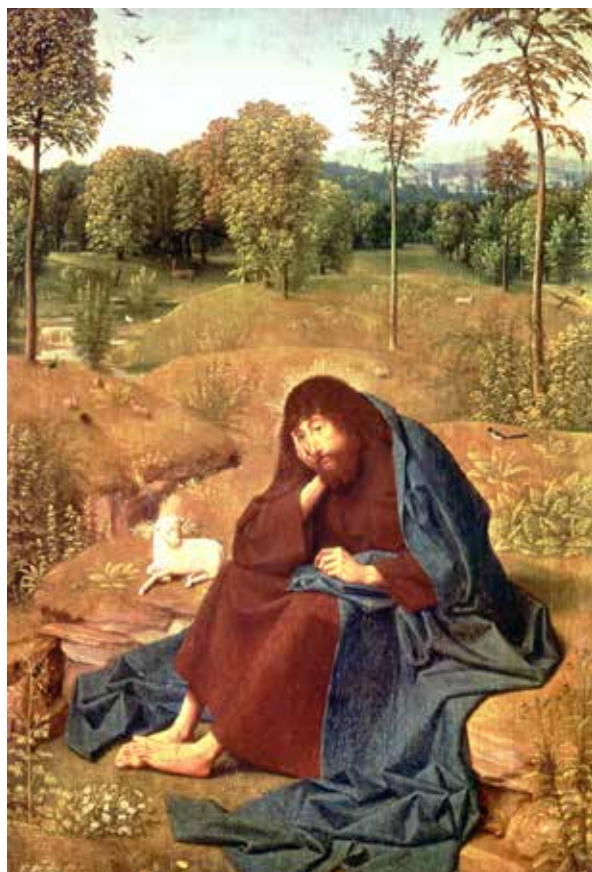
'John the Baptist in the Wilderness', Geertgen tot Sint Jans (c1490)