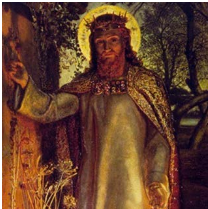
'The Light of the World' (Detail) William Holman Hunt (1851-53)

Diocese of Melbourne - Anglican Church of Australia Parish Church of the City since 1846