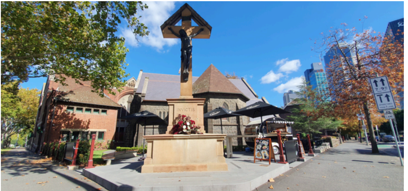
St Peter's Place, War Memorial Wayside Cross, 2020