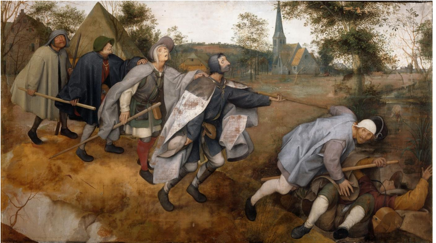
Pieter Bruegel the Elder (1525 - 1569) The Blind Leading the Blind

Diocese of Melbourne – Anglican Church of Australia Parish Church of the City since 1846