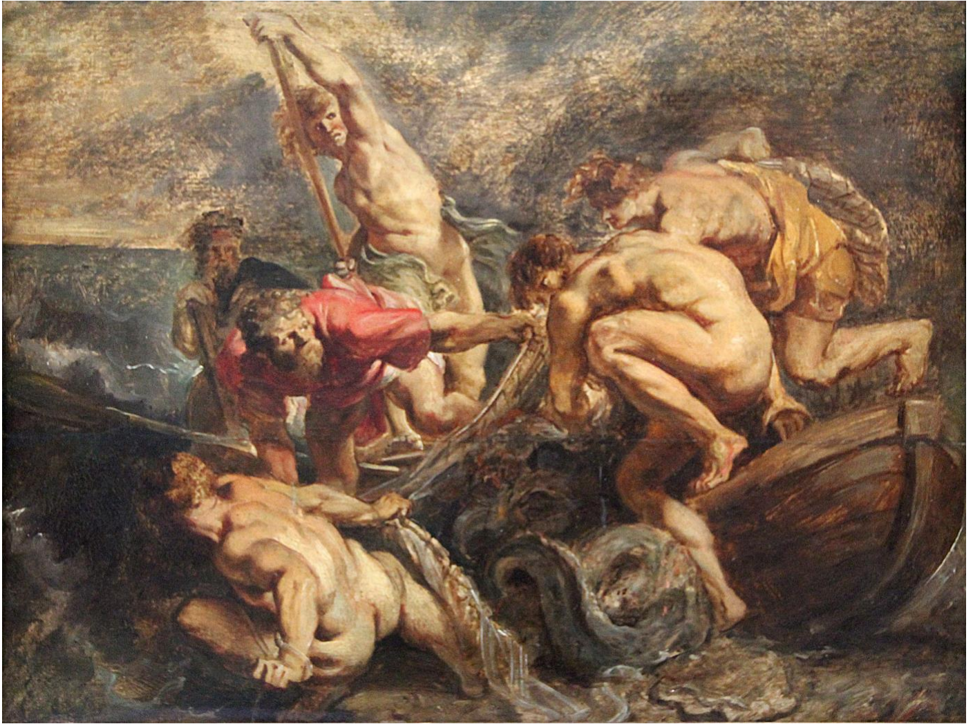
Peter Paul Reubens (1577 – 1640) The Miraculous draught of fish

Diocese of Melbourne – Anglican Church of Australia Parish Church of the City since 1846